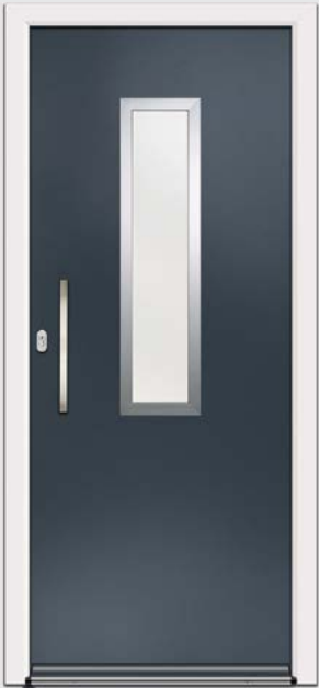
Glazing: Glazed Colour: Anthracite