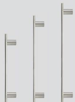
Flat Pull Bar