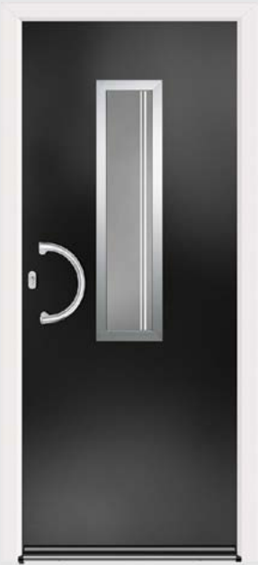
Glazing: Claro Colour: Black