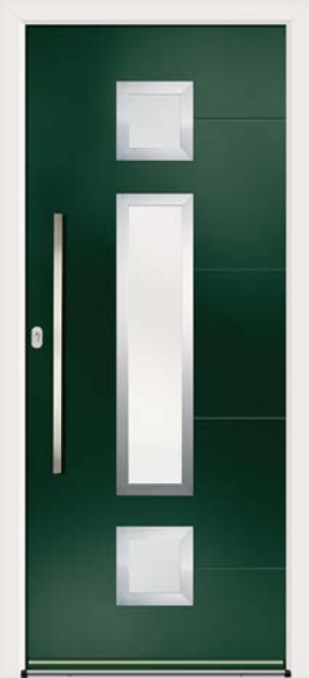
Glazing: Glazed Colour: Green