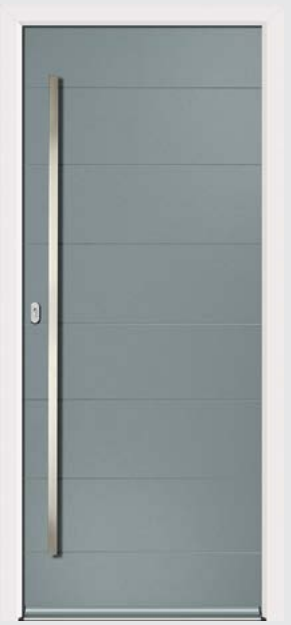
Glazing: N/A Colour: Silver Grey