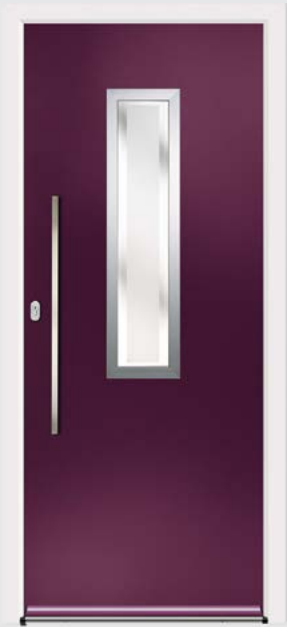
Glazing: Claro Colour: Plum