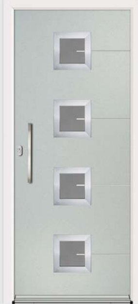
Glazing: Cresto Colour: Pebble