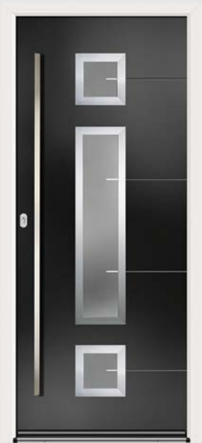
Glazing: Cresto Colour: Black