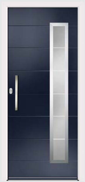
Glazing: Blanco Colour: Blue