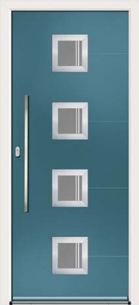
Glazing: Claro Colour: Midnight