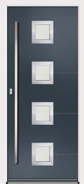
Glazing: Glazed Colour: Anthracite