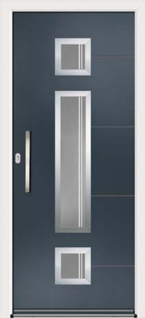
Glazing: Claro Colour: Anthracite