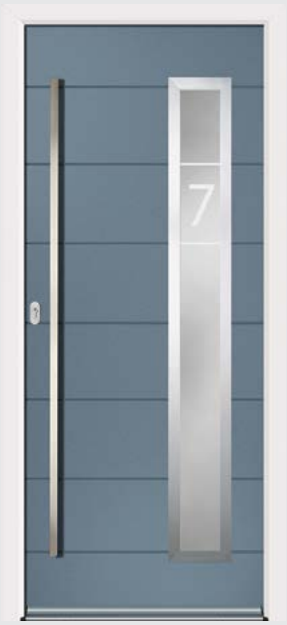
Glazing: Fora Colour: Slate