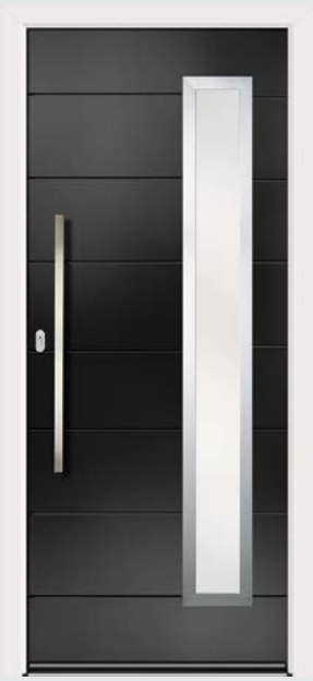
Glazing: Glazed Colour: Black