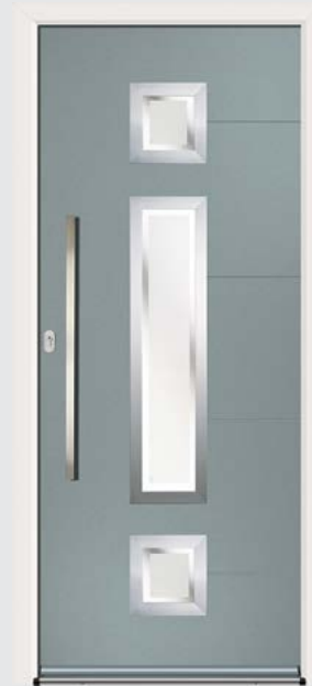
Glazing: Belice Colour: Silver Grey