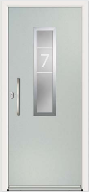
Glazing: Fora Colour: Pebble