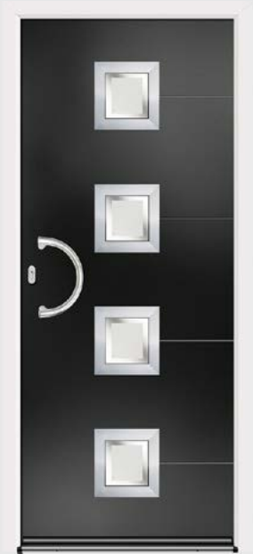
Glazing: Belice Colour: Black