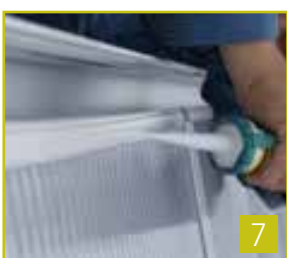
9 Fit Sheet Edge Trim