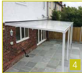
4 Main Frame Erected