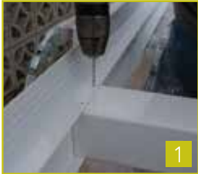
1 Fix Posts To Eaves Beam Gutter