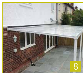
8 Secure Posts