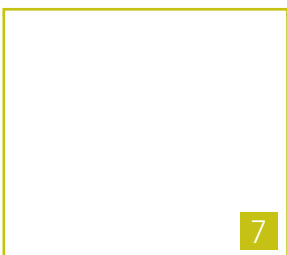
7 Engage Panel Bar Fully Into Wall Plate