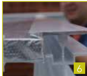
6 Panel Installation