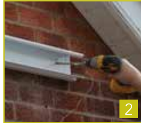
2 Fix Wall Plate To Wall