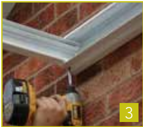
3 Fix Posts To Wall Plate