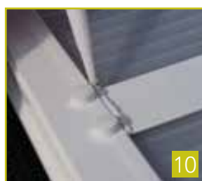
10 Finish With A Bead Of Silicon