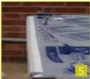
5 Fit The PVC Sheets